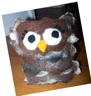
An owl pillow front made in "I Feel Like Scrap" class.