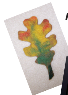
Make a leaf hot pad for your Thanksgiving table.