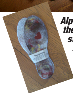
Alpaca Insoles, the perfect stocking stuffers!