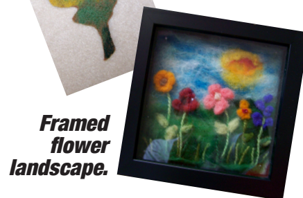
Framed flower landscape.