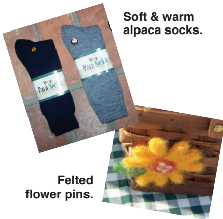
Soft & warm alpaca socks.

Sonny Sightings . . . keep up on where Sonny or his barnmates might be appearing by following him on Facebook. Search "Sonny Alpaca" and hit "Like"