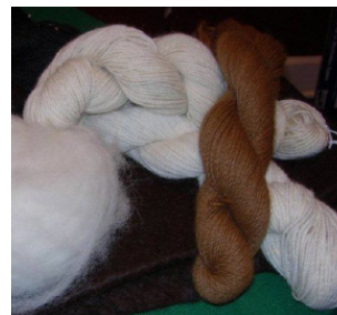
Rovings & Yarn